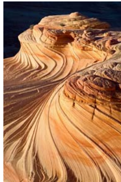
Sandstone Swirls, Guy Schmickle