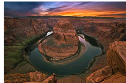
Horseshoe Bend Sunset, Guy Schmickle