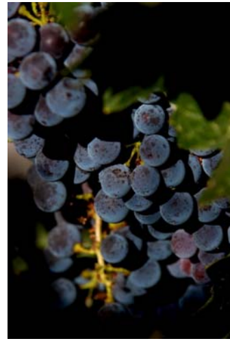
Colorado Wine Grapes, Wen Saunders